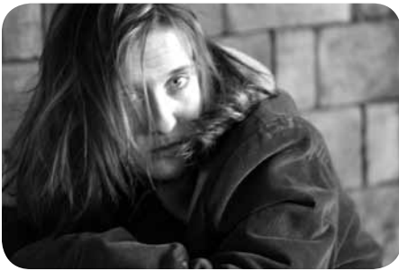
Young people who live on the street often lack the options or resources to make it on their own.

A staff person told him it was her birthday the next day and then explained: "She ages out of the shelter tomorrow."